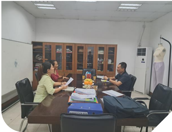
Kamcaine MFG (Myanmar) Co.,Ltd