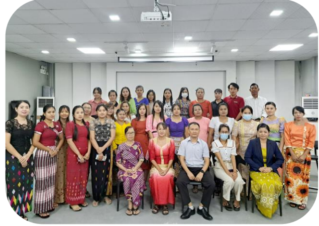
BATCH – 18 GROUP PHOTO

In accordance with mandatory of MGMA, the purpose of this training is to strengthen compliance with labour law awareness in the garment factories.