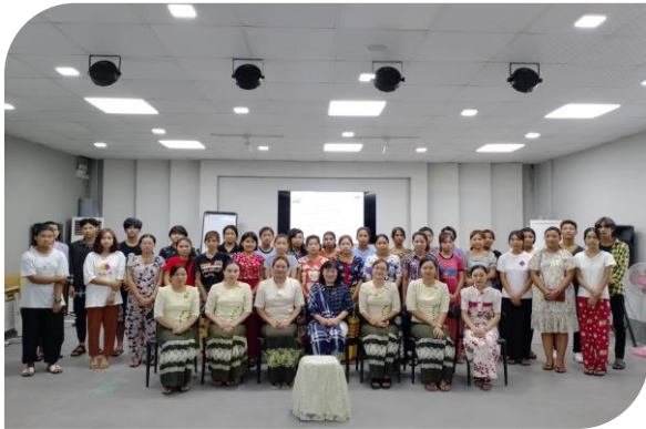
Batch – 221 Group Photo