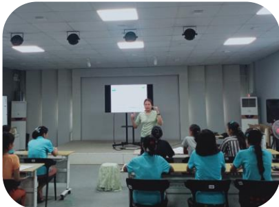
Trainer of MGHRDC Presenting Training Method

In this course, the trainer conducted parts of the fabric such as bag cover, spiral, shoulder corner seam, pocket, different types of bags, simple zip method, how to install a zipper, sewing sailor's tongue, long sleeve shirt and "A" skirt with belt. In addition, (6) special sewing method such as Buttonhole sewing machine , how to sew button using sewing machine , Bartack Machine, Overlock 4 thread, Overlock 5 thread, 2 Needle taught by trainers from MGHRDC with practice session. The training attended by (10) trainees.