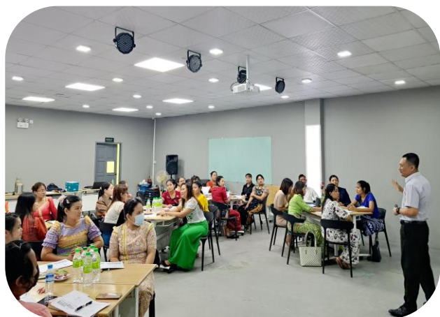
LABOUR OFFICER OF MGMA LECTURING LABOUR LAW AWARENESS