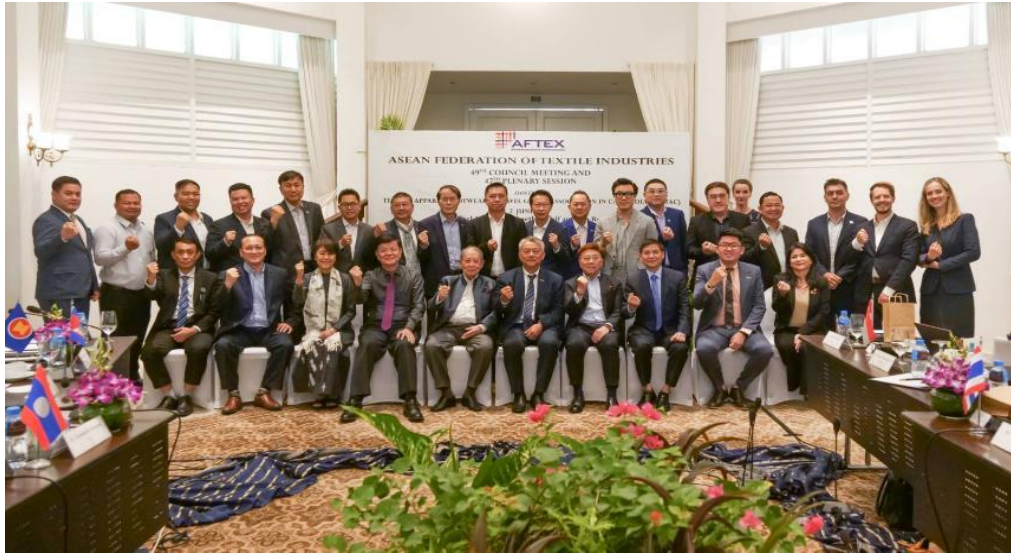
All Delegates of AFTEX Member Group Photo