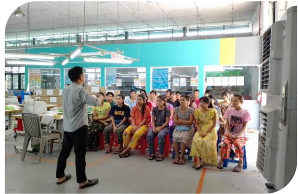
MGMA Conducting Labour Law Awareness

Basic Sewing Machine Operator Training (Batch – 220) was held on May 15 th to June 2 nd , 2023 at Myanmar Garment Human Resources Development Training Center (MGHRDC), organized by Myanmar Garment Manufacturers Association (MGMA).