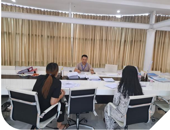
Kaixi (Myanmar) Fashion Co.,Ltd

Voluntary Labour Compliance Assessment Program of Myanmar Garment Manufacturers Association (MGMA) scrutinized (6) member factories in June 2023. They are Kaixi (Myanmar) Fashion Co.,Ltd, Feng Teng Garment Co.,Ltd, Golden KTK Garment, Kamcaine MFG (Myanmar) Co.,Ltd, An&Brothers Manufacturing Co.,Ltd, and New Forest Co.,Ltd.