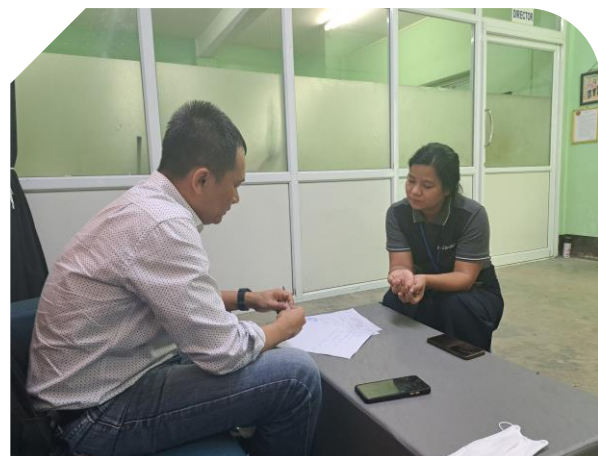
An & Brothers Manufacturing Co.,Ltd

Inspected various factories that Kaixi (Myanmar) Fashion Co.,Ltd on 6 th June, Feng Teng Garment Co.,Ltd on 7 th June, Golden KTK Garment on 9 th June, Kamcaine MFG (Myanmar) Co.,Ltd on 14 th June, An & Brothers Manufacturing Co.,Ltd on 15 th June and New Forest Co.,Ltd on 27 th June.