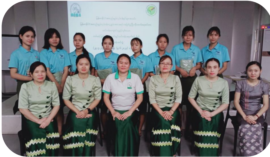
Batch – 3 Group Photo

M yanmar Garment Manufacturers Association (MGMA) organized Advanced Sewing Machine Operator Training (Batch - 3) was held on May 29 th to June 9 th , 2023 at Myanmar Garment Human Resources Development Training Center (MGHRDC).