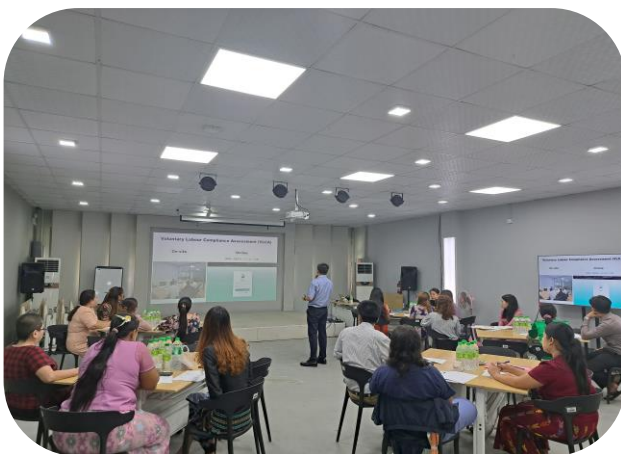
LABOUR OFFICER OF MGMA LECTURING LABOUR LAW AWARENESS

Staffs of HR department and production team from members' factories joined the training. Total (48) participants from (26) member's factories attended the training. MGMA will hold this training in monthly basis regularly as part of sustainable development goal in garment industry.