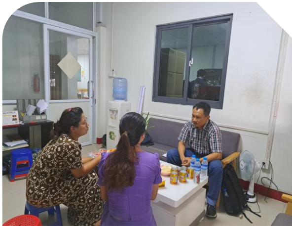
Feng Teng Garment Co.,Ltd