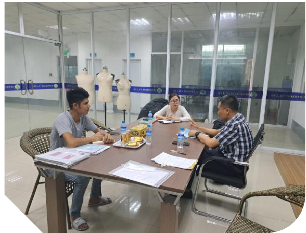
New Forest Co.,Ltd