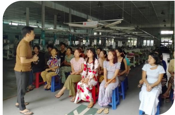
MGMA Conducting Labour Law Awareness

Basic Sewing Machine Operator Training (Batch – 221) was held on June 5 th to 23 rd , 2023 at Myanmar Garment Human Resources Development Training Center (MGHRDC), organized by Myanmar Garment Manufacturers Association (MGMA).