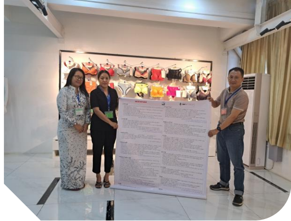
Kaixi (Myanmar) Fashion Co.,Ltd