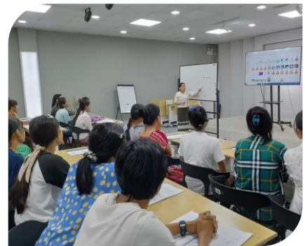
Trainer of MGHRDC Presenting Training Method