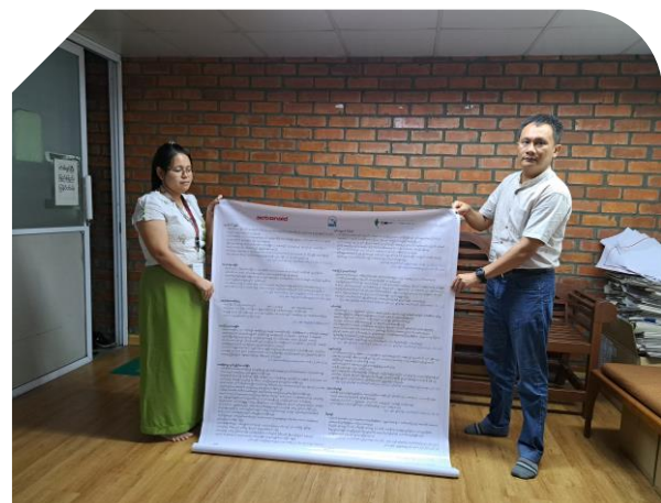
Golden KTK Garment