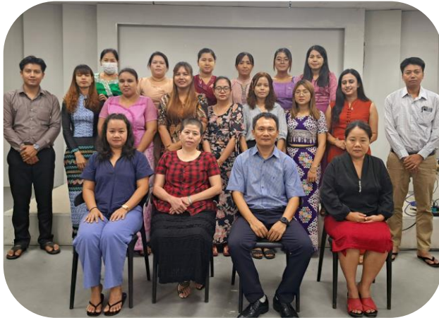
BATCH – 17 GROUP PHOTO

L abour Law Awareness Training was held on June 16 th and 22 nd , 2023, at Myanmar Garment Human Resources Development Training Center (MGHRDC), organized as compulsory training of Batch (17 & 18 ) by Myanmar Garment Manufacturers Association (MGMA).