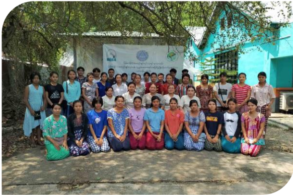
Batch – 220 Group Photo